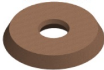
silica sand breaker